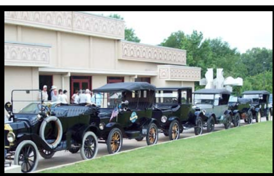
Model T's lined up for fun on the summer tour in OK