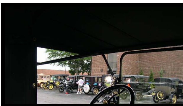
A T's eye view of the Ocean-to-Ocean tourers

Arkansas Tin Lizzies, a local chapter of the Model T Ford Club of America