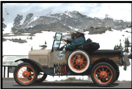
In June it was in the mid to high 90's at home but in the Rocky Mountains. on the CO/WY Tour Joe and Betty were all bundled up