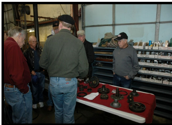
Transmission and flywheel balancing