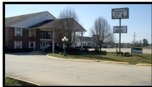
Southern Belle Inn in Nashville

Thursday there will be an optional tour going to Cassatot River State Park & Natural Area and a special stop at Center Point. It will leave at noon from the motel. Friday's tour of 100+ miles is still in the planning stage.