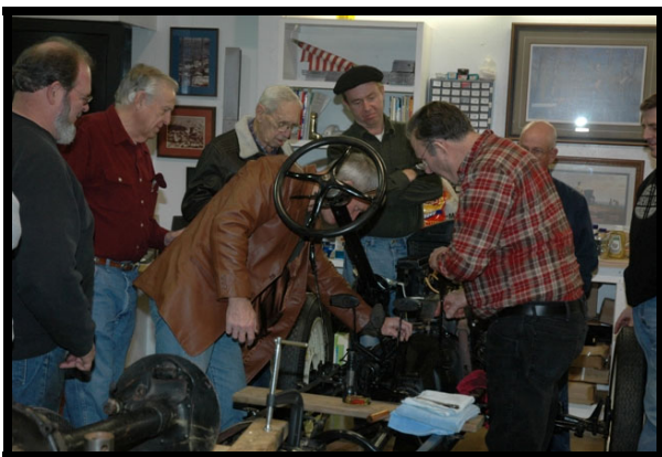
Changing transmission bands

Arkansas Tin Lizzies, a local chapter of the Model T Ford Club of America