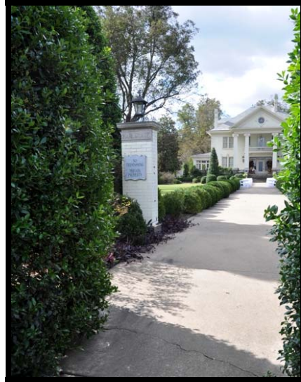
Marlsgate Plantation, Scott, Arkansas