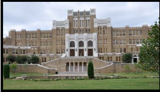
Central High School