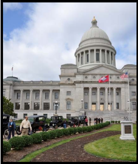
T's lined up in front of the Arkansas State Capitol

Arkansas Tin Lizzies, a local chapter of the Model T Ford Club of America