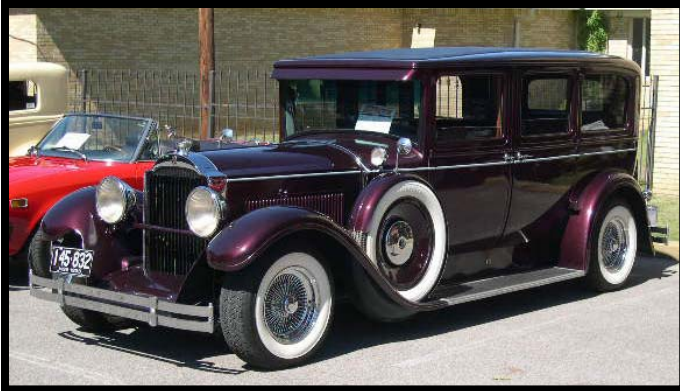
Clockwise beginning top left: '29 Packard Limo, Restored Jacinto Courthouse, "Elvis", Silver Moon Club.