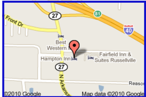
From I-40 take exit 81 south on Hwy 7 at Russellville.

Call the Hampton Inn for reservations by February 11. It is located at 2304 North Arkansas Avenue in Russellville (479-858-7199.) The rates for the Arkansas Tin Lizzies will be $79.00 per night.