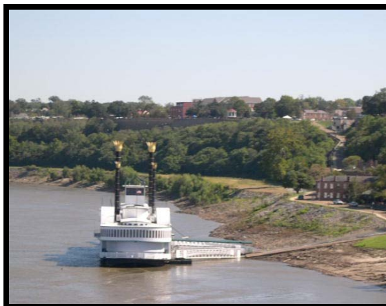
The Big Muddy at Natchez