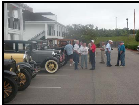
and to greet friends, old and new.

Our meeting in Vicksburg was a great gathering of Model T's and A's. Sixteen cars hailing from Arkansas, Tennessee, Alabama, Mississippi and Louisiana made up the group; everyone was an enthusiastic tourer. The club was pleased to have several folks from Magnolia Model T Ford Club of Mississippi. The tour took in sights and historic places from Vicksburg to Natchez. By Wednesday afternoon all were gathered at the motel to make plans