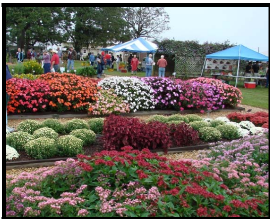
Fall Flower and Garden Show in Crystal Springs

Arkansas Tin Lizzies, a local chapter of the Model T Ford Club of America